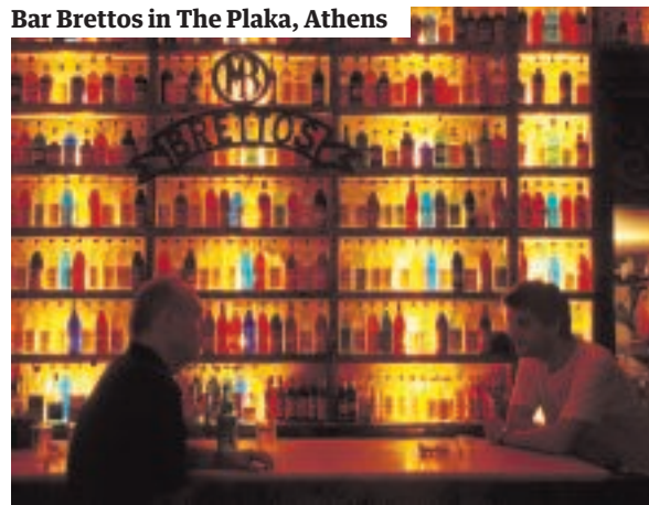
Bar Brettos in The Plaka, Athens