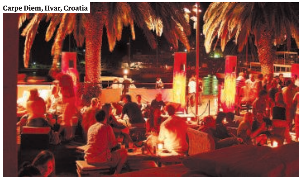
Carpe Diem, Hvar, Croatia

only too happy to recommend beers for you; I tried a number of trappist ales. It's on the west side of the square, away from the tourist-heavy north wise, and popular with locals. Markt 16 (craenburg.be). CLM76