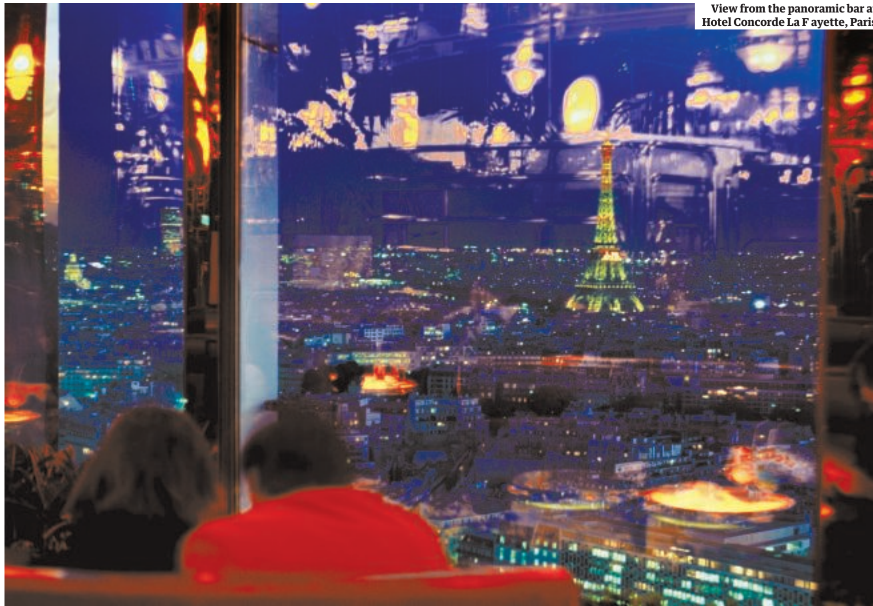
View from the panoramic bar at Hotel Concorde La Fayette, Paris

Gaststätte Plümecke, Hanover A classic German pub, with traditional (not stylish) interior where you can find people of all classes and professions. You will get local beer (Herrenhäuser pils) and delicious pub classics such as currywurst, french fries (probably the best in town) or Frikadeller (meatballs). Vossstrasse 39; U-Bahn: Lister Platz, Torben