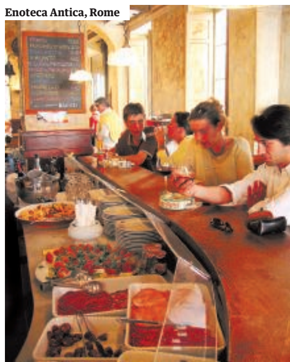
Enoteca Antica, Rome